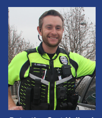
End of Watch Oct. 16, 2020